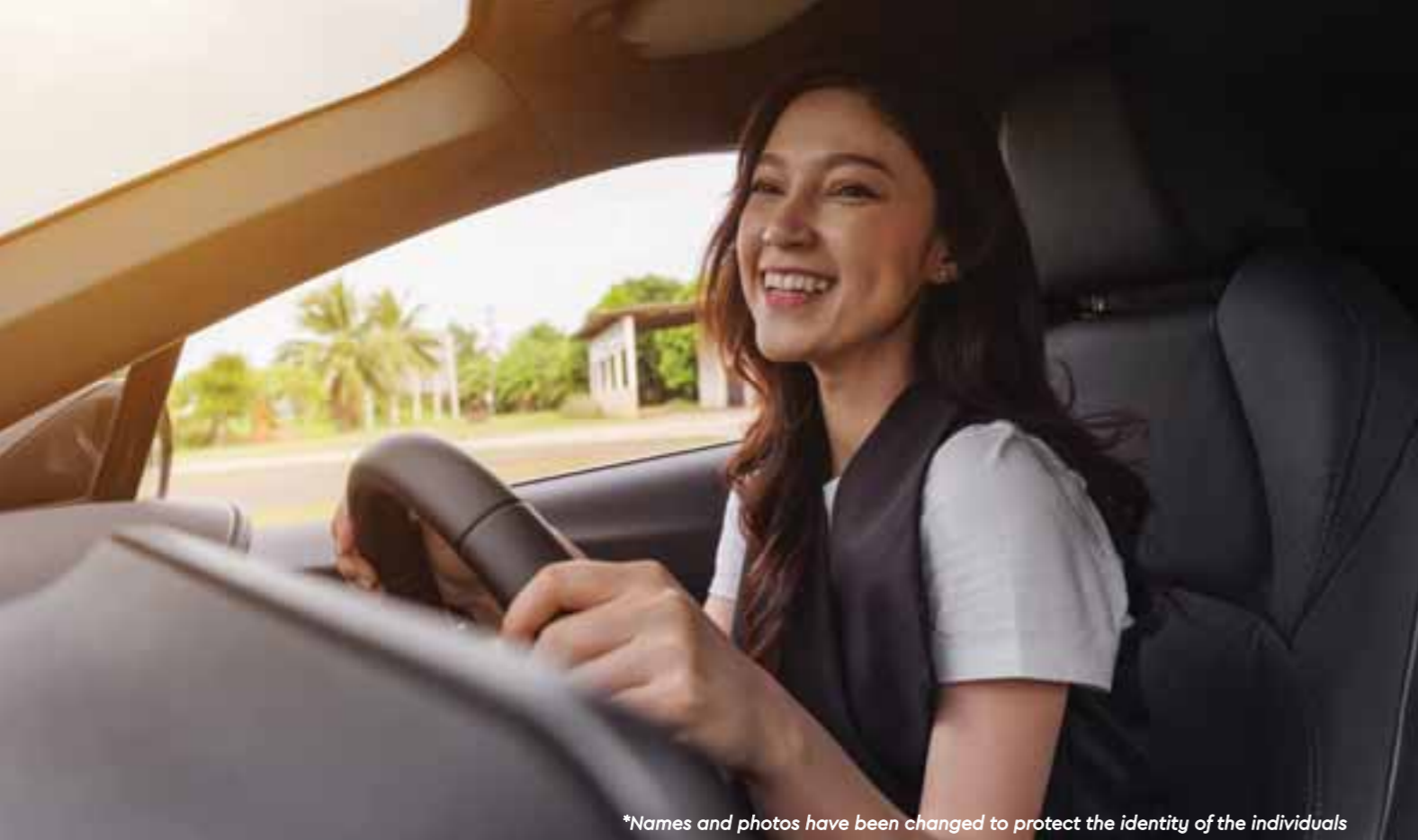
*Names and photos have been changed to protect the identity of the individuals