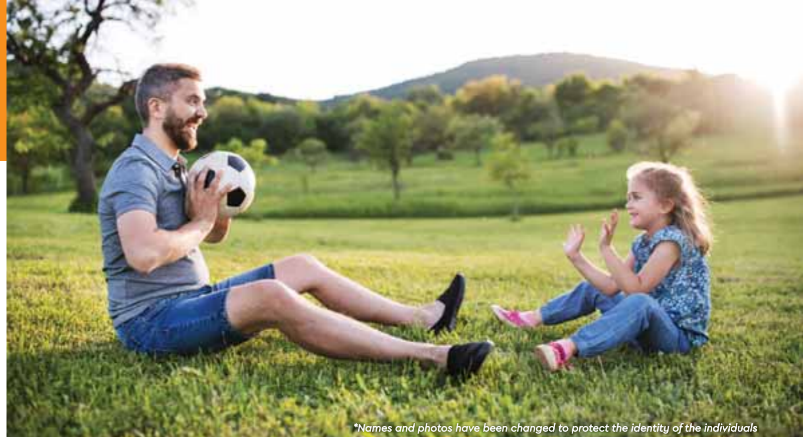
*Names and photos have been changed to protect the identity of the individuals