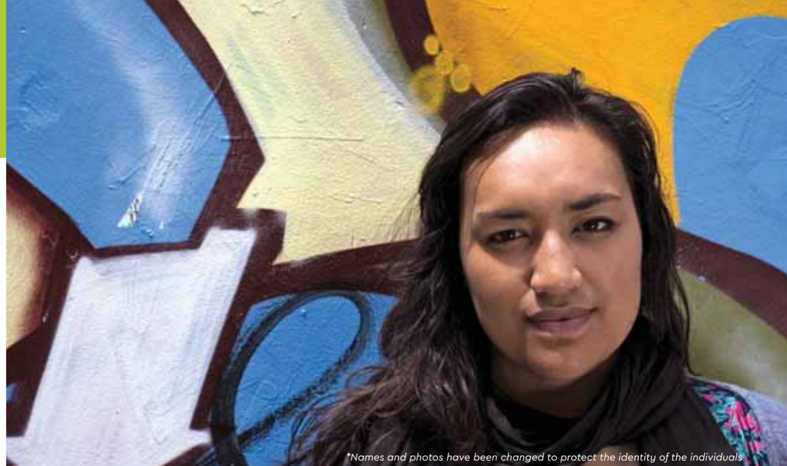
*Names and photos have been changed to protect the identity of the individuals